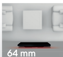
Minimum distance to the wall